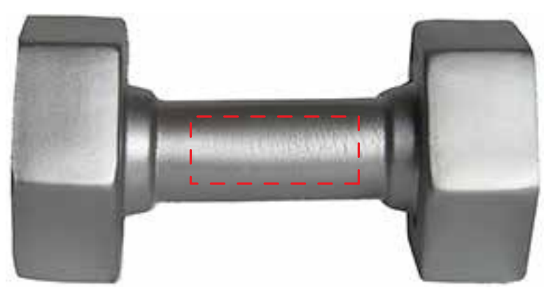
4" X 2"